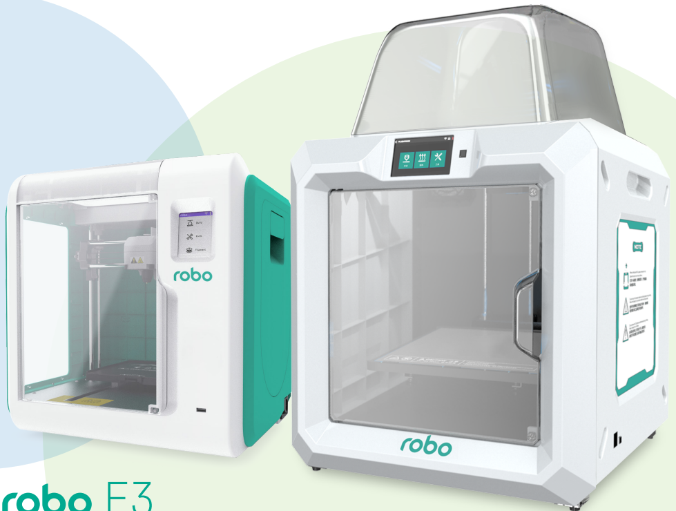
robo E3 Compact 3D Printer

Wi-Fi + Hot Spot enabled for Chromebook and iPad compatibility including Robo cloud printing.